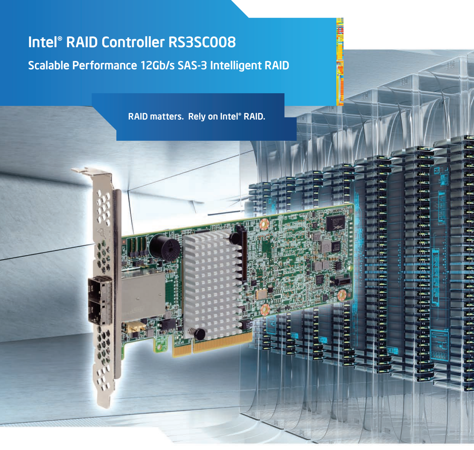
Industry-leading performance and scalability for leading-edge datacenters