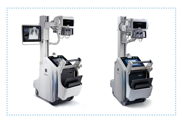
Figure 2. Intel® Distribution of OpenVINO™ toolkit optimizes workloads across multiple Intel® processors.

"AI is not a one-size-fits-all solution. It's about going beyond the imaging machine to make it intelligent with software..."