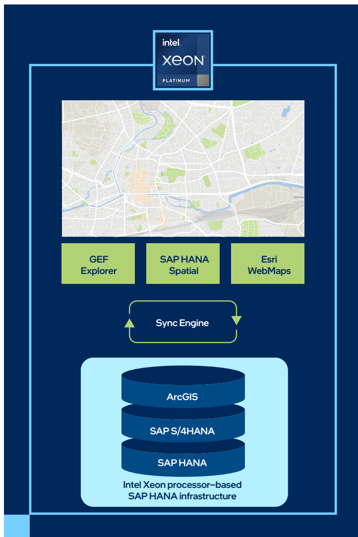
Figure1. Solution architecture