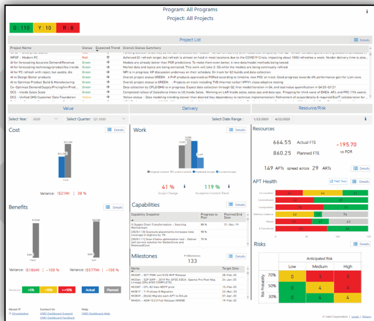
Alignment on Capability and Milestone Commits