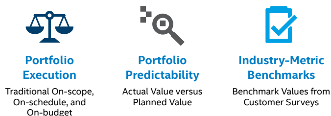
Figure 3. Measuring the maturity of our Agile PMO includes execution, predictability, and industry benchmarks.